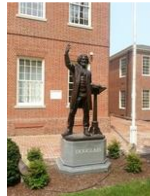
Civil Rights activist Frederick Douglass is honored with a statue in Talbot County, MD (a General Code client).

For more cool stories about our fantastic clients in Massachusetts, Missouri, Maryland and other states, check out our board on Pinterest!