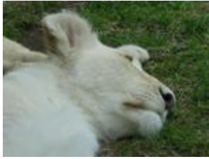
A White Lion Cub

From vicious dogs to regulating breeding operations and defining what constitutes a therapy animal, local governments legislate to protect citizens and animals alike. And when stories surface about large snakes roaming neighborhoods or alligators showing up in backyard pools, the concern skyrockets.