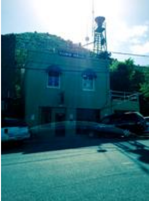
Jerome, Arizona Town Hall

Thank you to the following municipalities for choosing to partner with us on your current codification projects!