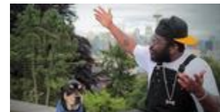
From the Puget Sound PSA video "Dog Doogity"

Check out GovLoop's article about how government agencies are using music videos to reach out to their constituents: " Turn It Up: How Government Uses Music Videos to Engage Citizens "