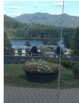
Lake Placid, New York